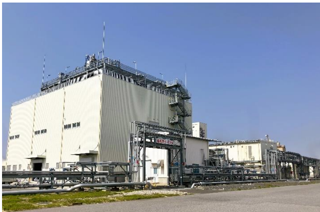
Appearance of Plant 1

With this capacity increase, we have expanded our solid electrolyte sample supply capacity from several tons per year to more than a dozen tons per year. We also have facilities for mass production technology development. Idemitsu will accelerate technological verification to establish mass production technology in a large pilot facility as the next stage, aiming for practical application of all-solid-state batteries in 2027 to 2028, and beyond that, commercialization of solid electrolytes.