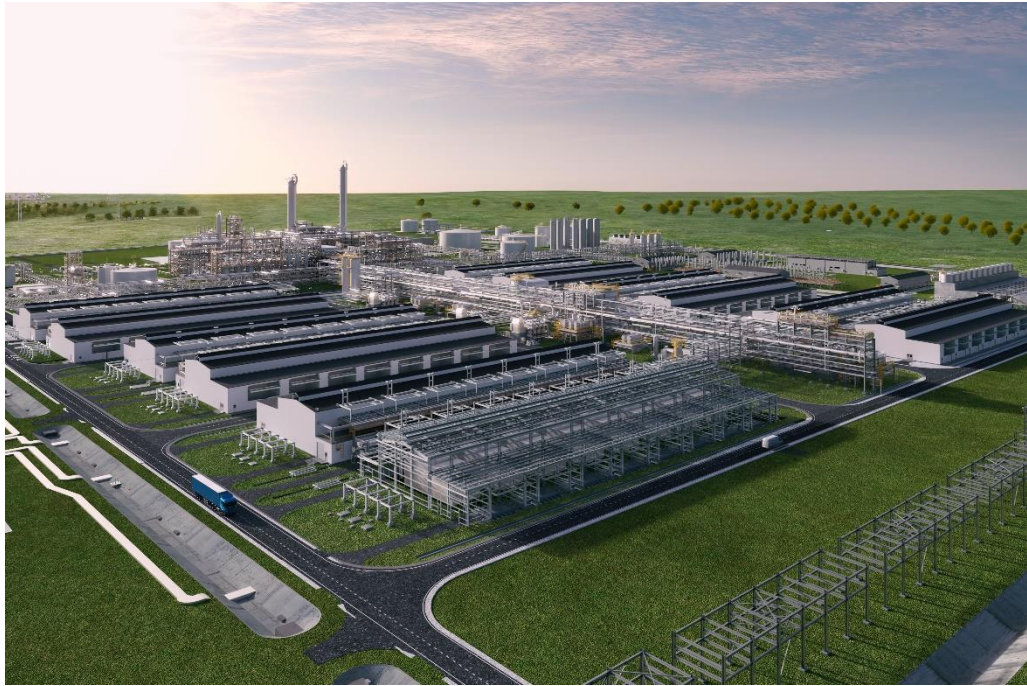
e-methanol production project image (HIF, Matagorda, Texas, USA)

Idemitsu will conclude the Master Investment Agreement with JOGMEC concerning investment in HIF. And Idemitsu will make a joint investment with JOGMEC (about 36 million US dollars investment from JOGMEC) through Idemitsu Efuels America Corp. ("IEAC"), which is a US subsidiary of Idemitsu.