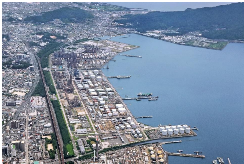
Tokuyama Complex, the planned construction site of the HEFA-SAF production facility (center of photo)